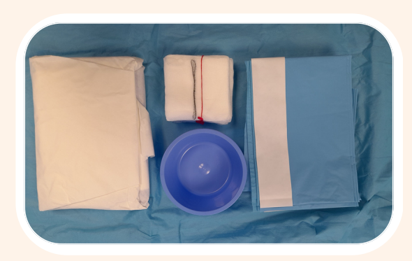
A Peripatetic drape pack with XLarge Gown