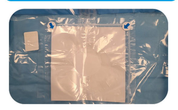
Procedure Pack Four supports exotic procedures Exotic Vet drape Pack